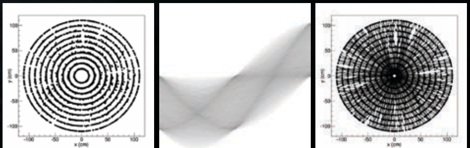
Hough transform algorithm applied to a simple example. Left: Hits in a simulated event with curved tracks. Centre: Each hit results in a curve of votes in parameter space. Locations with many votes are likely to be tracks in the original data. Right: Candidate tracks identified from finding local maxima in the parameter space.

Results also show the algorithm the team has chosen easily satisfy the processing time constraints set by the trigger system up to luminosities where 250 proton-proton interactions occur at the same collision. At these